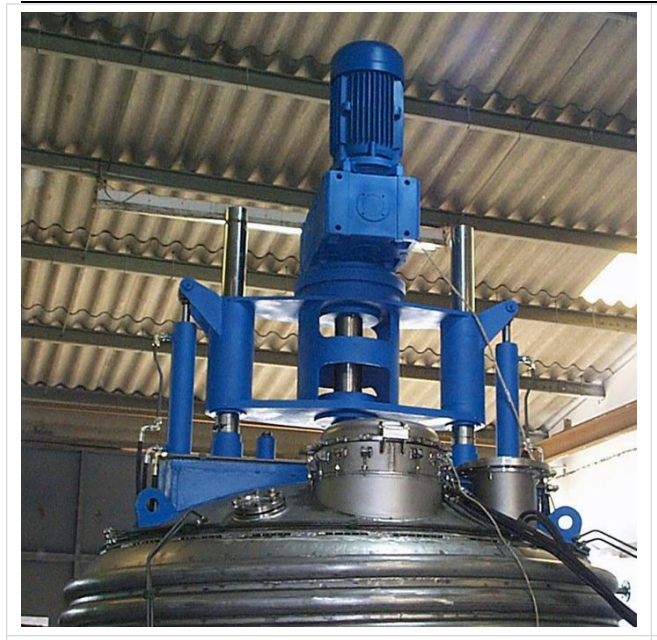
Drive System of PNF Nutsche Filter

Tel: +86-133-9116-8218 Fax: +86-21-3375-8218 www.permixtec.com Shanghai, 201807, China www.permix-mixing.com