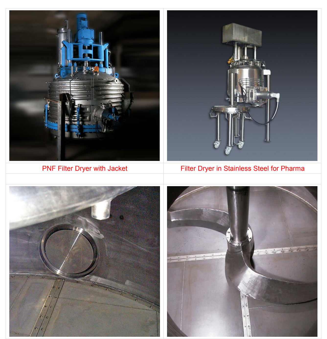
Discharge Valve of PNF Nutsche Filter