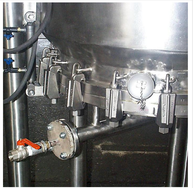
Fast Clamping System of Nutsche Filter Dryer