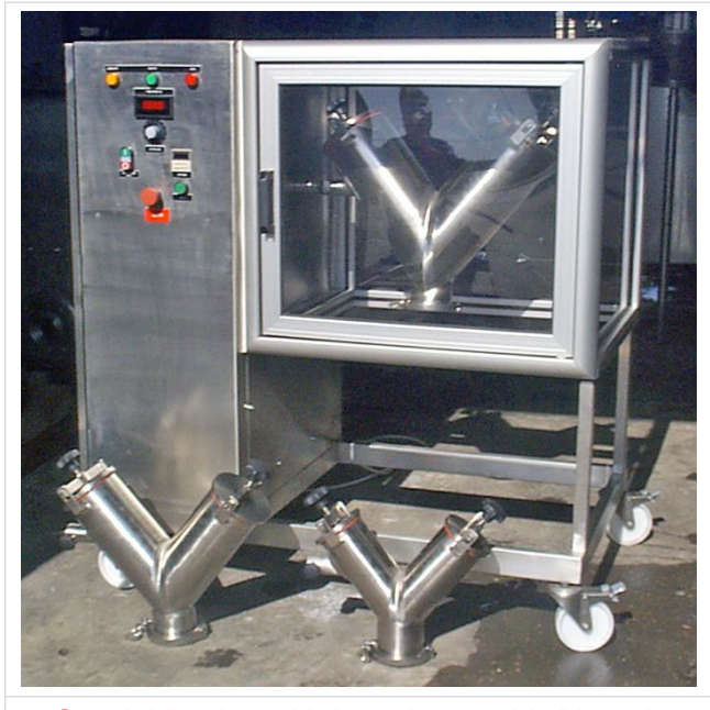
Special Design with Interchangeable Vessels