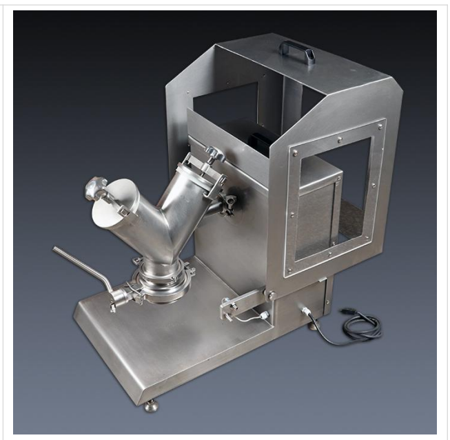
Lab-size PVM-5 Mixer